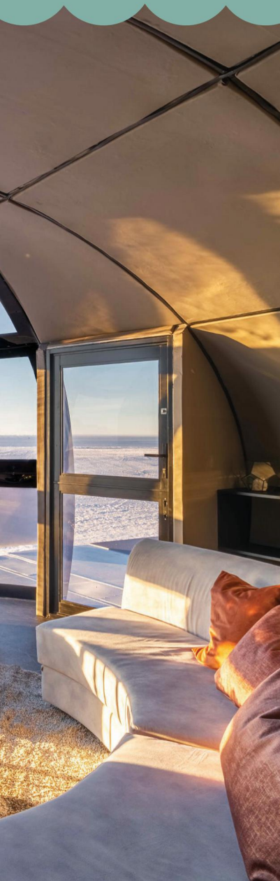
WHITE DESERT: ANDREW MACDONALD; RAS ABROUQ: COURTESY OUR HABITAS

no foundations, all waste is shipped out, the water is heated by solar arrays, and soaps are biodegradable. Green hydrogen power is in the cards soon as well, Woodhead says. For visitors, gazing out over the raw, untouched white desert is breathtaking and humbling all at once, a stark reminder of the planet's power, and its need for us to protect its coldest corners. A soft blanket and a whisky on the rocks await. —Annabel Illingworth