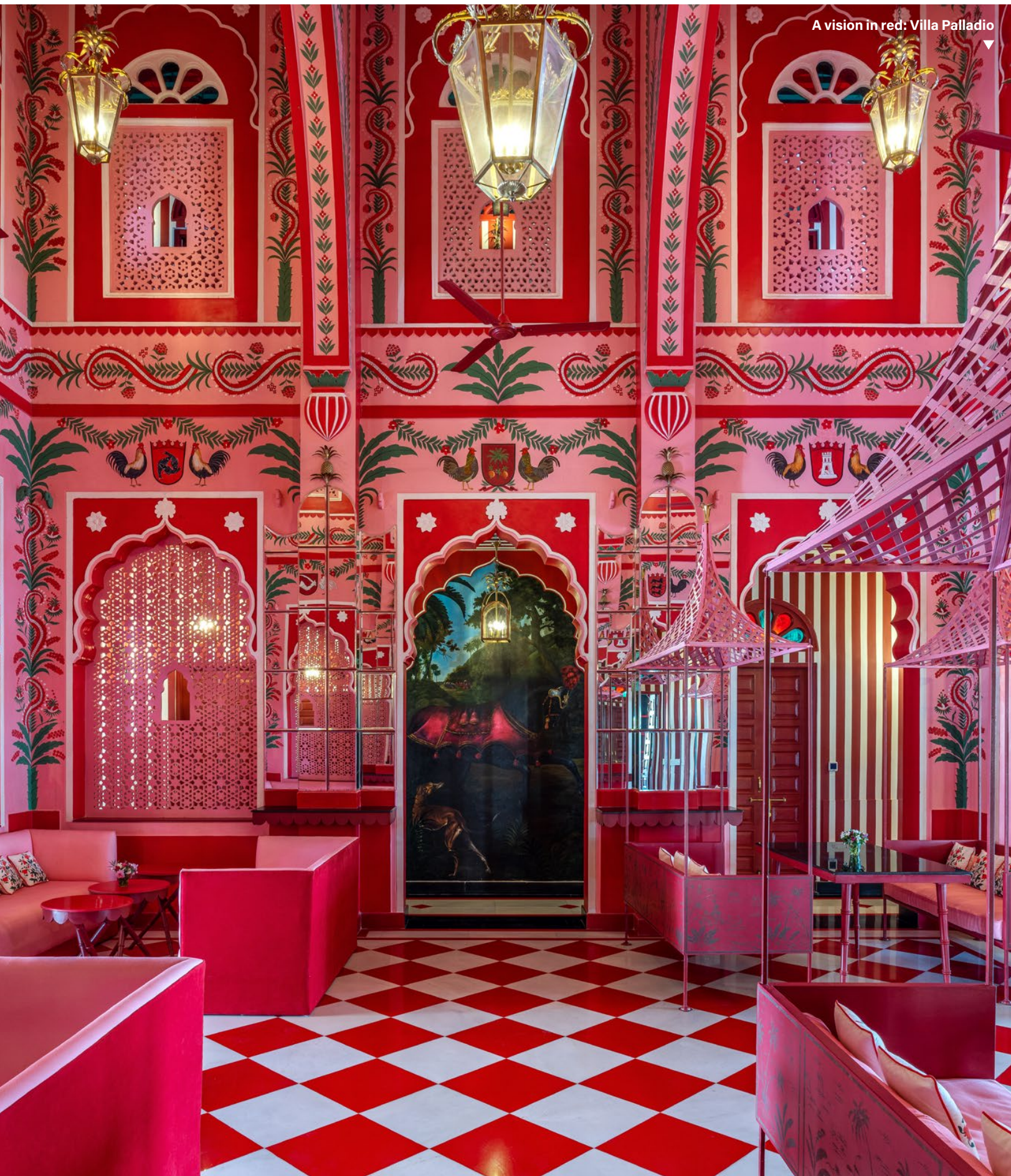
A vision in red: Villa Palladio