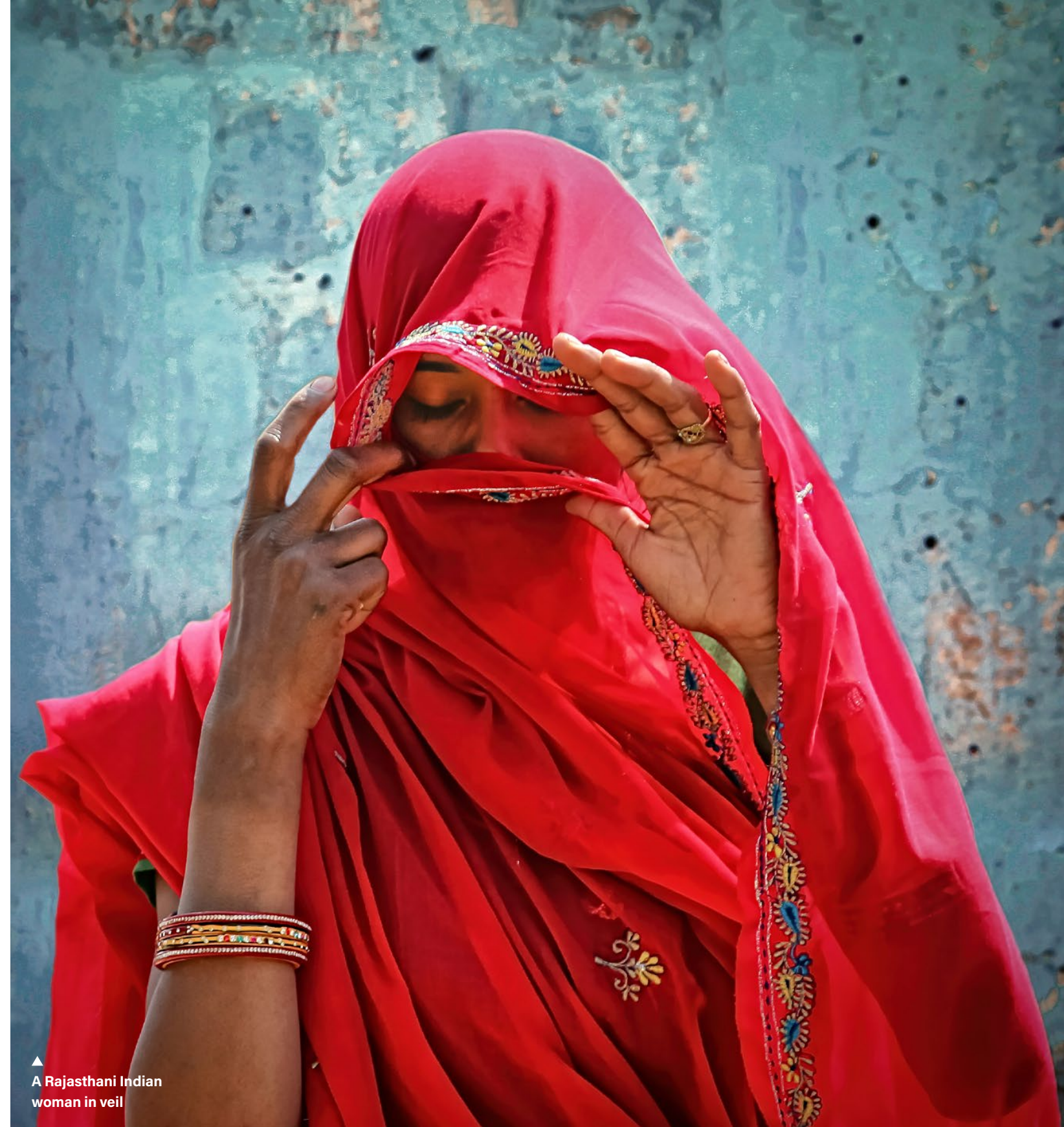
A Rajasthani Indian woman in veil