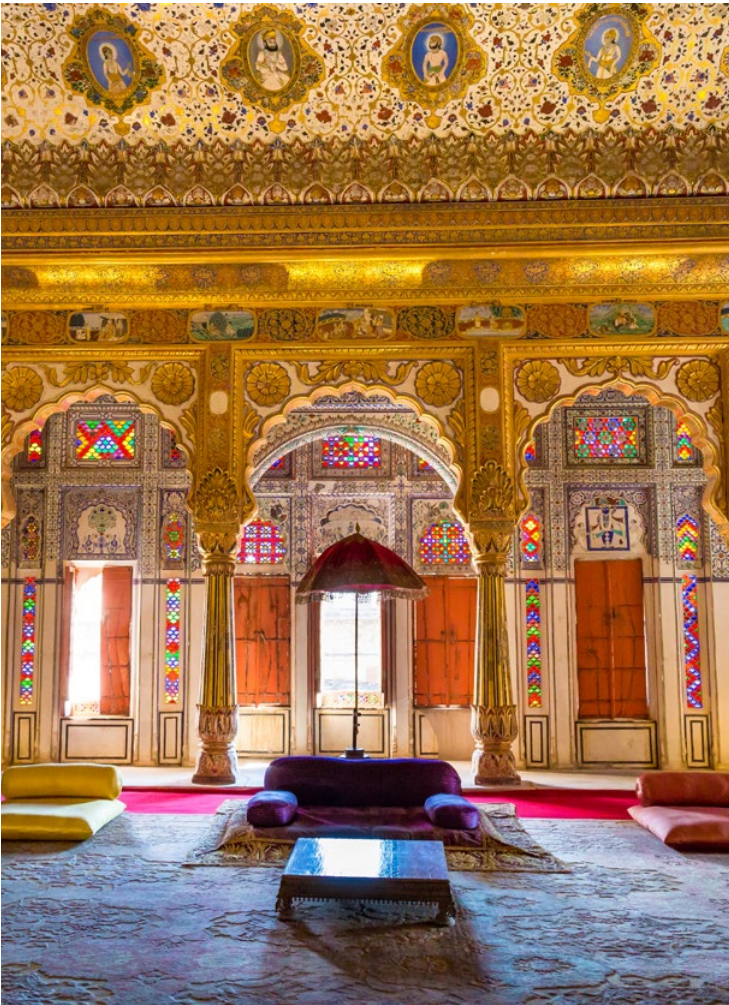
▼ Clockwise from top: All in the details: Pukhraj Lounge at The Johri Hotel Mughal architectural details at Nahargarh Fort, a Golden royal palace room at Mehrangarh Fort, Jodhpur

TEA: A tea break is easy to come by anywhere in Jaipur, of course, but for a fresh spin on a classic pastime, head to Tapri caf , which is frequented by young locals. Here, you’ll certainly find staples such as masala chai and cutting chai on the extensive tea menu, but you’ll also be able to sample Kashmiri kahwa, herbal tea laced with ashwagandha, lemongrass and mint, and an iced tea made with Red Bull for the ultimate caffeine kick. The vegetarian food menu is equally eclectic, courtesy of dishes such as tofu bhurji, Maggi noodles upgraded with parmesan cheese and pesto, and an eight-piece samosa platter. ☺