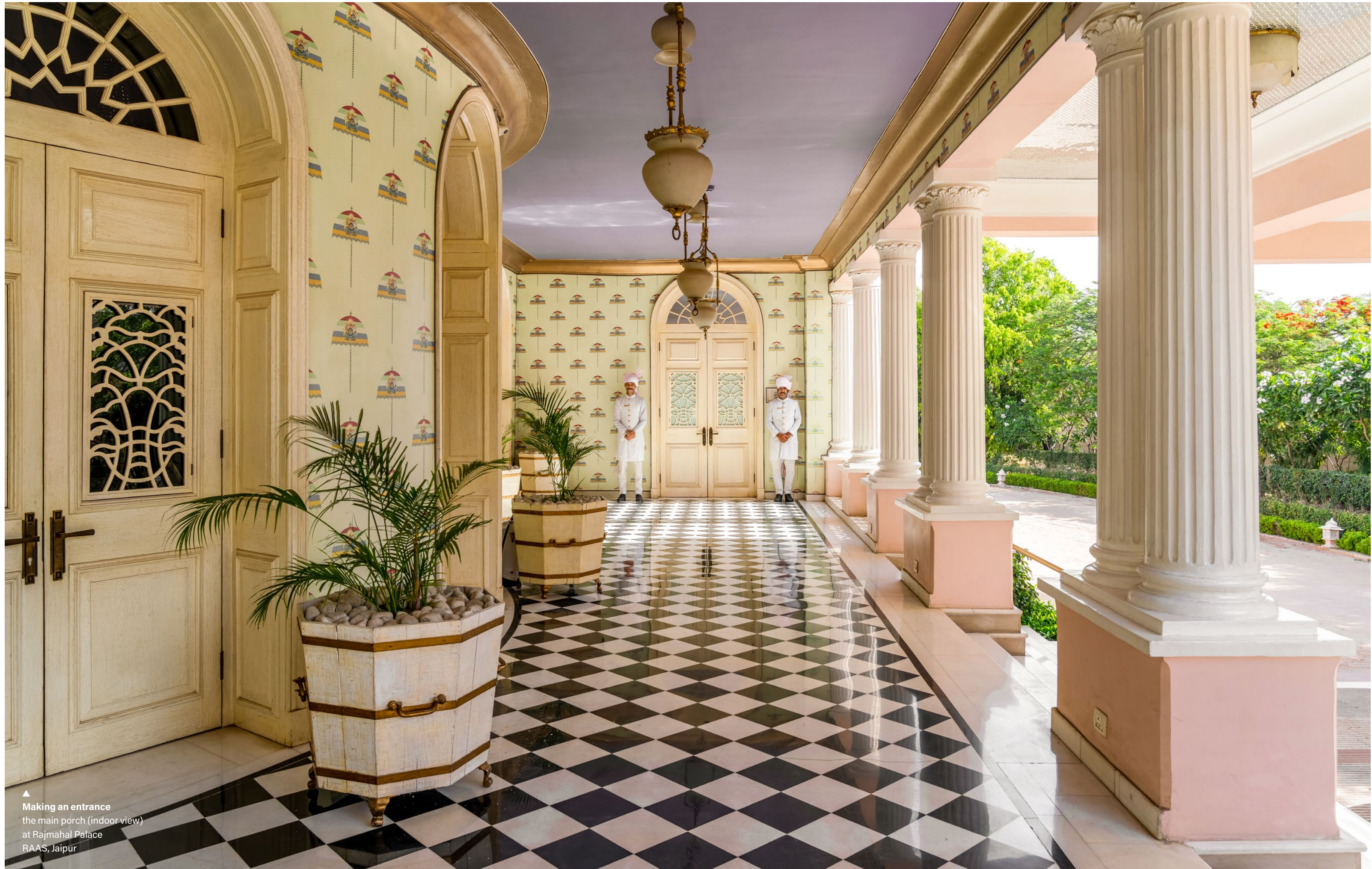
▲ Making an entrance the main porch (indoor view) at Rajmahal Palace RAAS, Jaipur