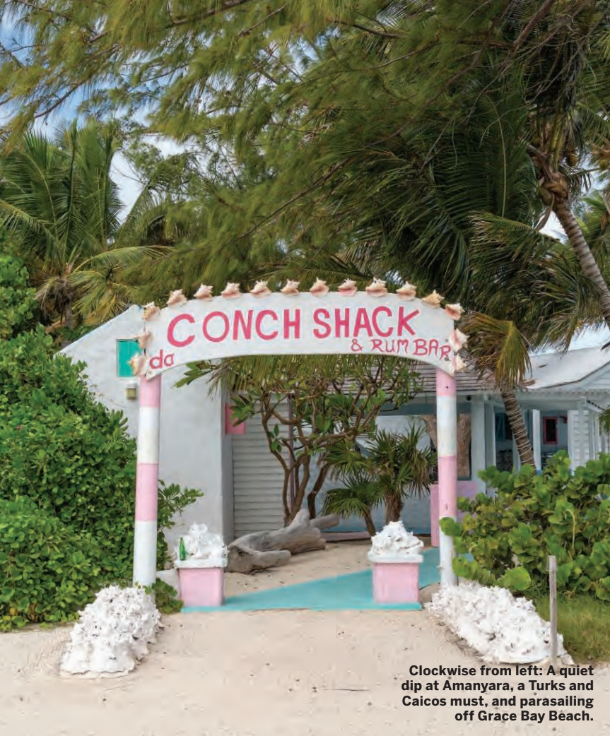
Clockwise from left: A quiet dip at Amanyara, a Turks and Caicos must, and parasailing off Grace Bay Beach.