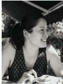
Photographer Lauryn Ishak Singapore