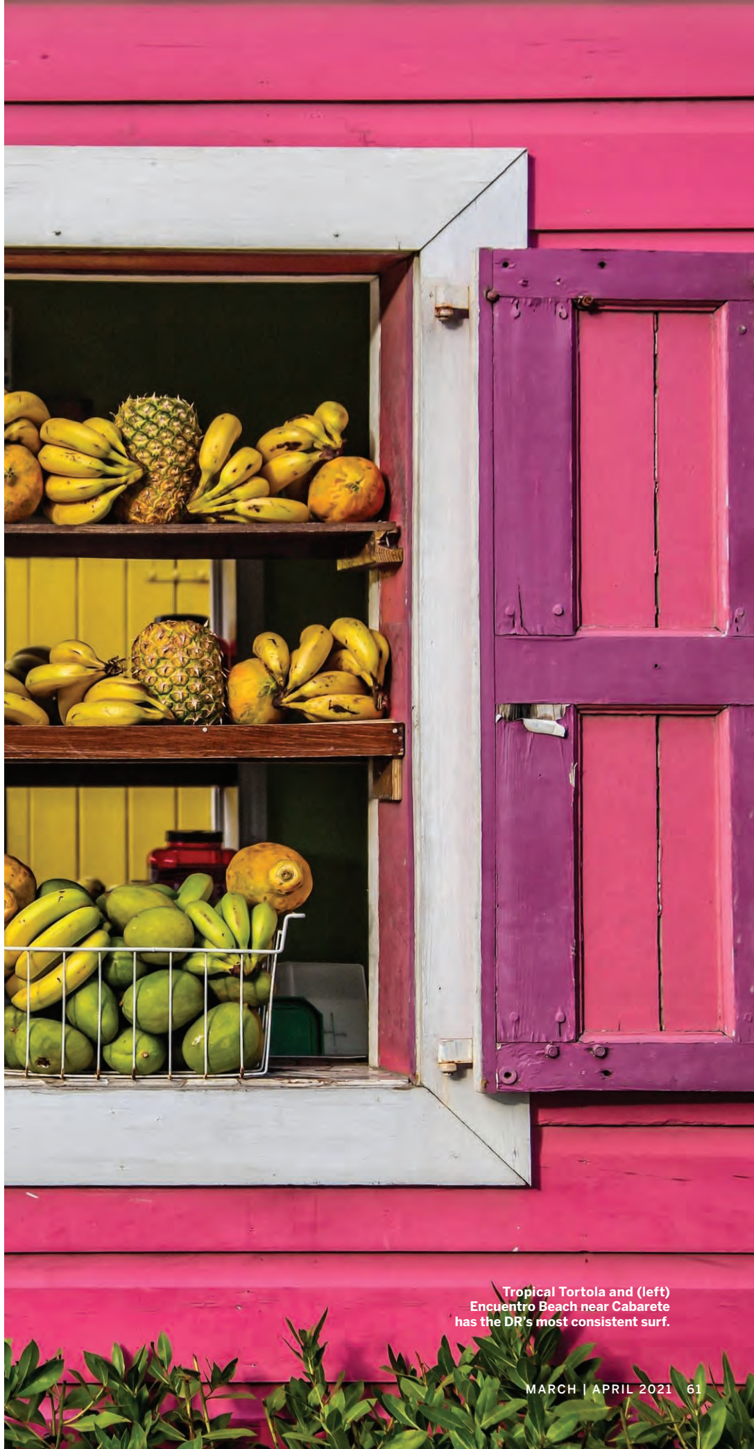
Tropical Tortola and (left) Encuentro Beach near Cabarete has the DR's most consistent surf.