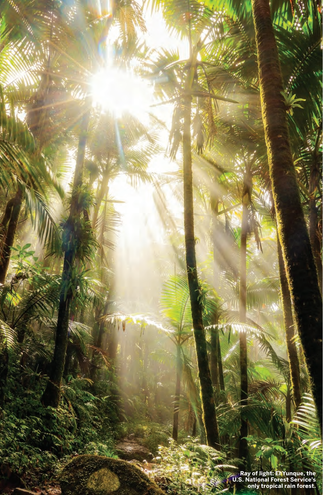
Ray of light: El Yunque, the U.S. National Forest Service's only tropical rain forest.