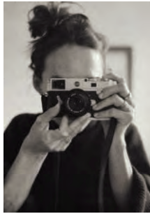
Photographer Lucy Laucht Cornwall, England "The Light Fantastic," page 80

THE REPORT: "I've always been drawn to beach scenes – the tones, textures, and sight of people relaxed and at play."