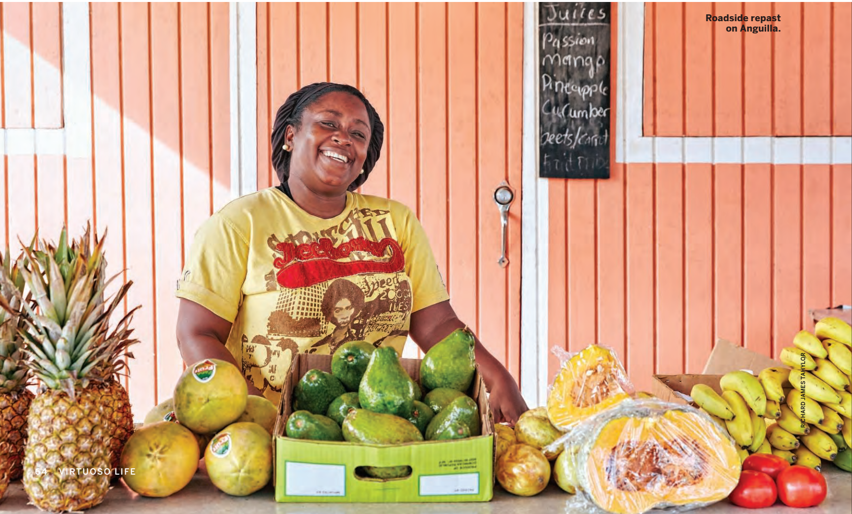
Roadside repast on Anguilla.