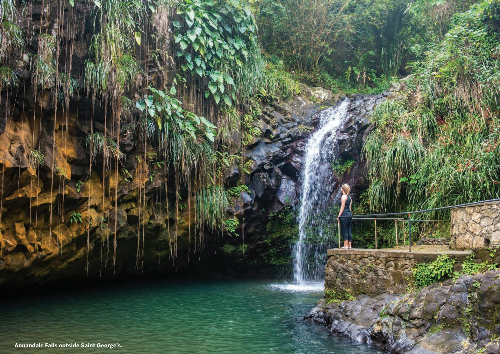
Annandale Falls outside Saint George's.