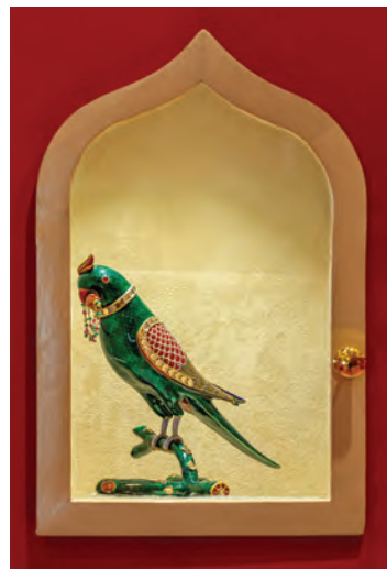
Clockwise from top left: Jawahar Circle's Patrika Gate, a Gem Palace scene, and Idli boutique.

Rajasthani favorites; luckily, they pack well for travel.