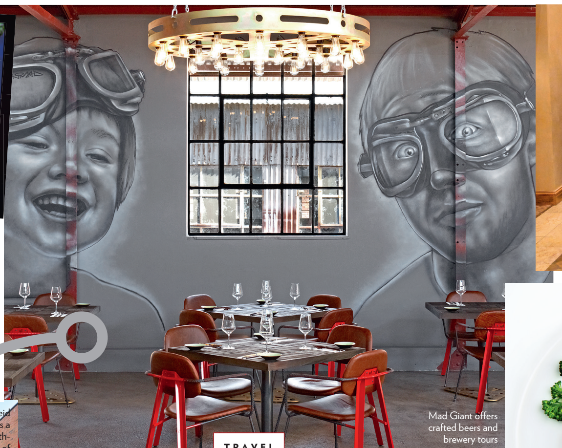
Mad Giant offers crafted beers and brewery tours

Get the Mervs, which has a fried egg served with boerewors sausage, biltong shavings and jalapeño mayo, or their shakshuka. The interiors are the stuff Instagram envy is made of.