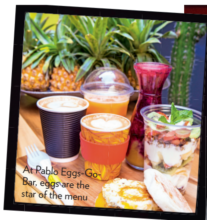
At Pablo Eggs-Go-Bar, eggs are the star of the menu