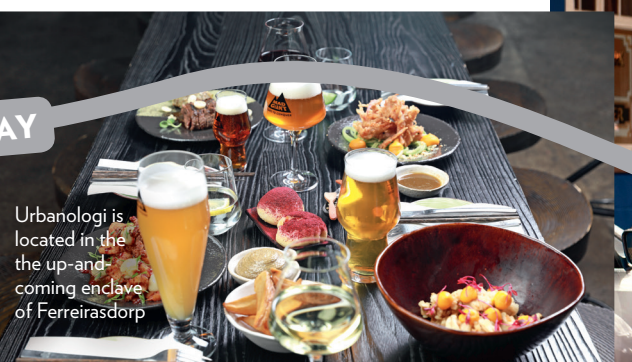
Urbanologi is located in the up-and-coming enclave of Ferreirasdorp