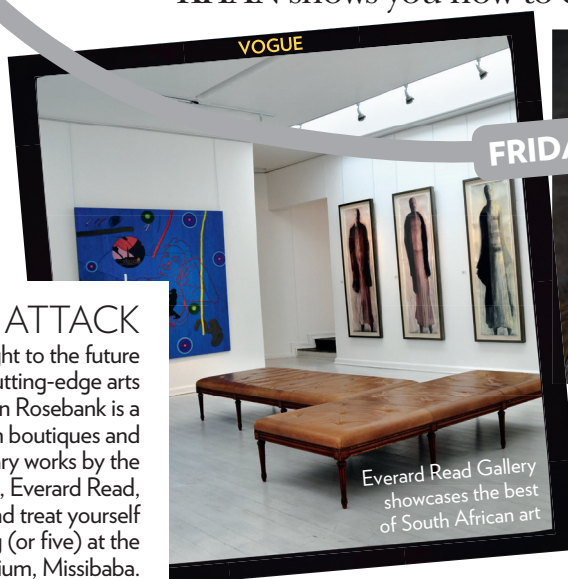
Everard Read Gallery showcases the best of South African art

From the past, head straight to the future with a look at South Africa's cutting-edge arts scene. The Keyes Art Mile in Rosebank is a trendy complex brimming with boutiques and galleries. Browse contemporary works by the country's rising stars at Circa, Everard Read, SMAC or Whatiftheworld, and treat yourself to a funky leather handbag (or five) at the colourful accessories emporium, Missibaba.