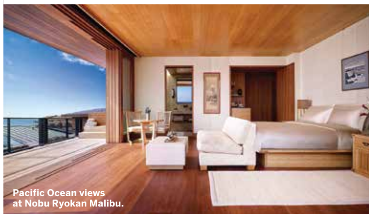
Pacific Ocean views at Nobu Ryokan Malibu.