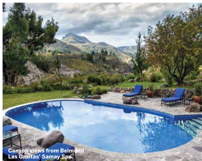
Canyon views from Belmond Las Casitas' Samay Spa.

The world's second-deepest canyon makes for an otherworldly backdrop at Belmond Las Casitas , a 20-bungalow hideaway near Peru's Colca Canyon. Belmond renovated an existing property, which features private plunge pools, heated floors, and an Inca-inspired spa hidden away in a eucalyptus grove – but the real stars here are the varied options for exploring the canyon terrain. Besides hiking, horseback riding, and feeding the house alpacas, guests can sign up for an Andean condor excursion that takes them trekking through a dormant volcano on a quest to spy the elusive vulture and ends with a chef-prepared brunch. Doubles from $600, including breakfast daily and a $100 spa credit.