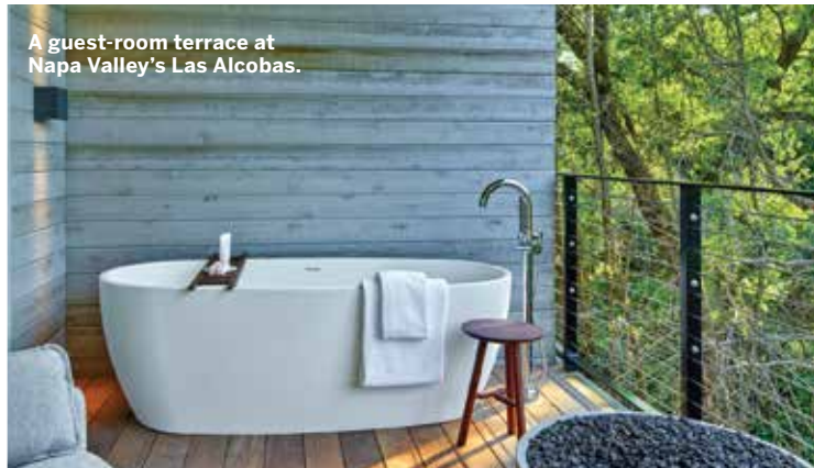
A guest-room terrace at Napa Valley's Las Alcobas.