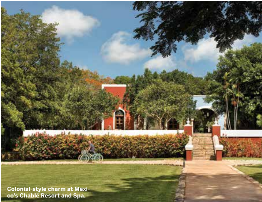
Colonial-style charm at Mexico's Chablé Resort and Spa.

Mexico is packed with great spa options, but Chablé Resort and Spa , a 45-minute drive from Mérida, stands out thanks to its setting, with 40 casitas spread across 750 acres of forest. The resort's crown jewel is, naturally, its spa, which is tucked away around a cenote and best experienced during the signature Fountain of Youth Journey Flow Ritual, a three-hour treatment that incorporates flotation therapy, massage, and herb-infused salts. Heat up the feel-good factor by adding a temazcal ceremony to your personalized wellness program – the shaman-led session claims to cleanse the body through fire, chanting, and tea. Doubles from $748, including complimentary airport transfers, breakfast daily, and a $100 resort credit.