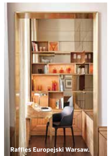
Raffles Europejski Warsaw.

● Details are scarce, but that hasn't stopped Brits from buzzing about the 54-room Belmond Cadogan Hotel, London , the Sloane Street gem set to open in late 2018. The Queen Anne-style building dates to 1887, but is currently undergoing a $48 million update. VI