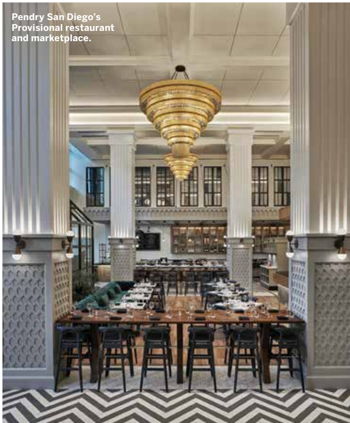
Pendry San Diego's Provisional restaurant and marketplace.

Chef Nobu Matsuhisa's global domination continues on a seaside stretch of Malibu. Along with an all-star team of investors – including actor Robert De Niro and Oracle CEO Larry Ellison – the restaurateur unveiled a new hotel concept in April: 17-room Nobu Ryokan Malibu , a minimalist, Japanese-style hideaway on Carbon Beach. The inn's easy-to-miss gates barely offer a hint of the understated opulence that lies behind: Each room cost more than $1 million to outfit, with teak soaking tubs, Jerusalem limestone, shoji-screen walls, and cashmere robes. The setting is ideal for yoga, meditation, and surfing, but its location next door to Nobu Malibu invites guests to indulge – at least a little bit. Doubles from $2,000, including breakfast daily and a $100 hotel credit.