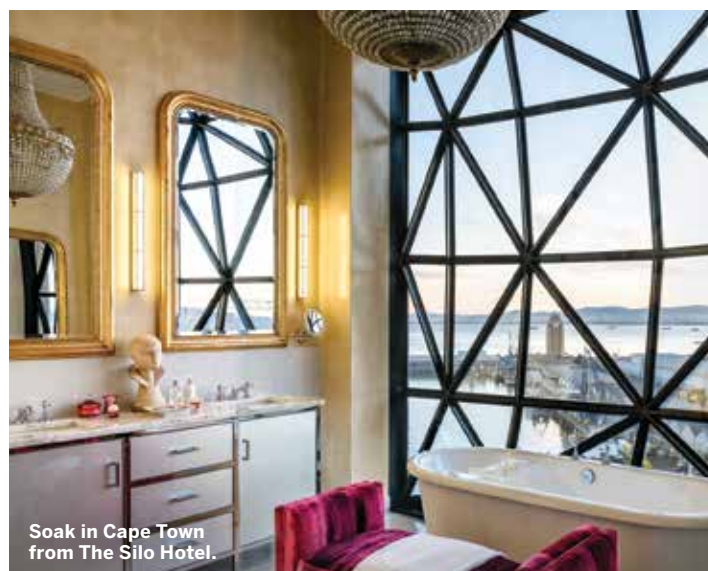
Soak in Cape Town from The Silo Hotel.

There's a good chance you've scrolled past a #bucketlist photo from The Silo Hotel on your social media feeds, with its sexy bathtubs set in front of convex glass windows overlooking the harbor or Cape Town's Table Mountain. Each of the 28 rooms at this sky-high hotel has one, along with glittering chandeliers, striking modern art, and bold pops of chartreuse, turquoise, and fuchsia. The hotel, which opened in March, sits atop the new Zeitz Museum of Contemporary Art Africa. Above both is a grand slam of a rooftop bar, with a private guests-only section for taking in 360-degree views of the South African city. Doubles from $1,161, including breakfast daily and a complimentary 50-minute massage for two.