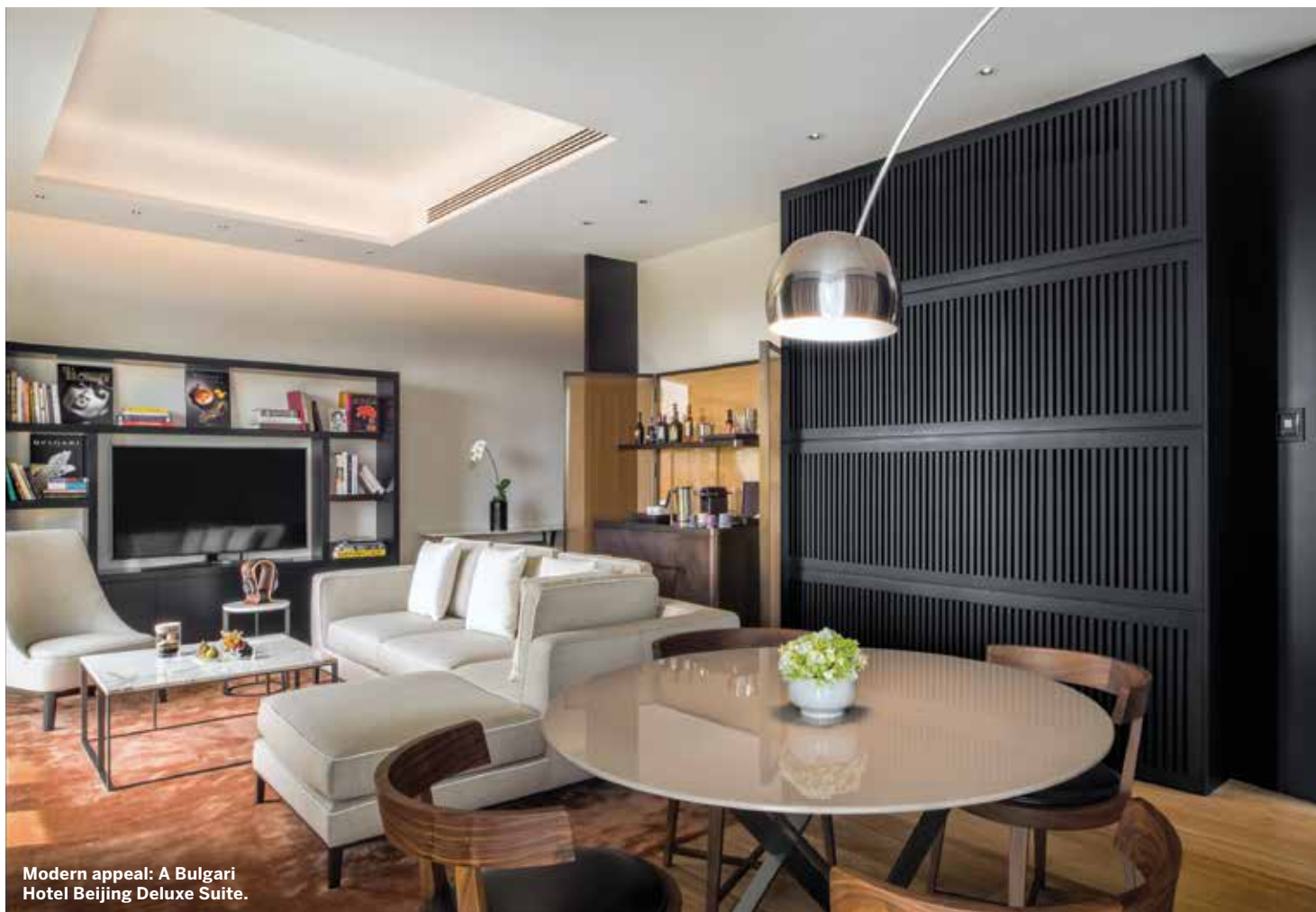
Modern appeal: A Bulgari Hotel Beijing Deluxe Suite.