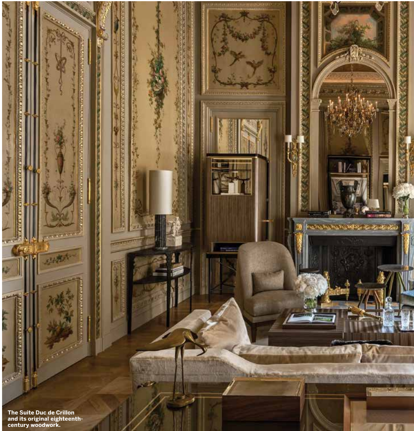
The Suite Duc de Crillon and its original eighteenth-century woodwork.