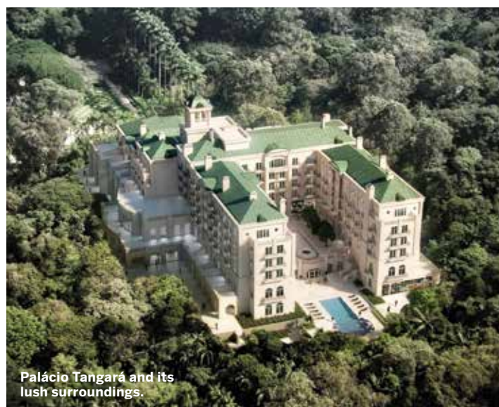
Palácio Tangará and its lush surroundings.

Picture São Paulo, and natural splendor probably isn't the first image that comes to mind. Yet somehow, in the middle of the sprawling Brazilian city, the 141-room Palácio Tangará elicits a calm "I'm in the middle of the rain forest" vibe. The neoclassical mansion is surrounded by verdant Bule Marx Park, and ambient noise here comes from hummingbirds and white-tufted-ear marmosets, not car horns and pedestrians. Dining options aim to please too: Jean-Georges Vongerichten's French cuisine at Tangará Jean-Georges marks the chef's first foray into the continent. Doubles from $287, including breakfast daily and a $100 dining credit.