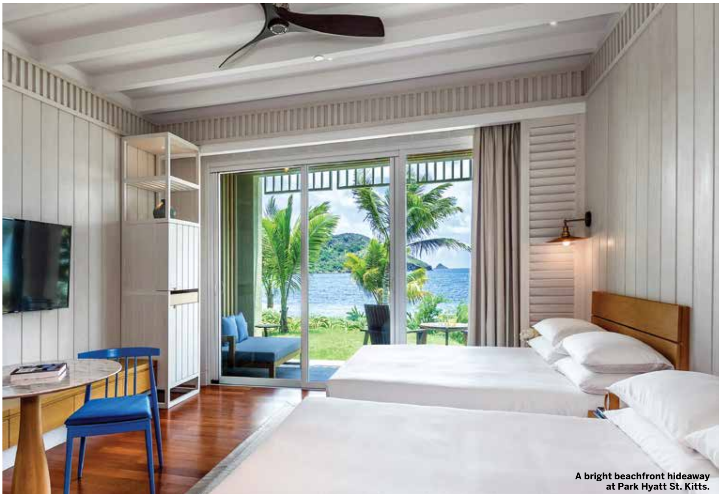
A bright beachfront hideaway at Park Hyatt St. Kitts.