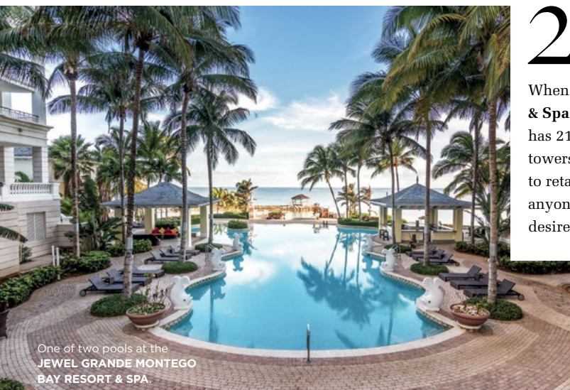
One of two pools at the JEWEL GRANDE MONTEGO BAY RESORT & SPA .