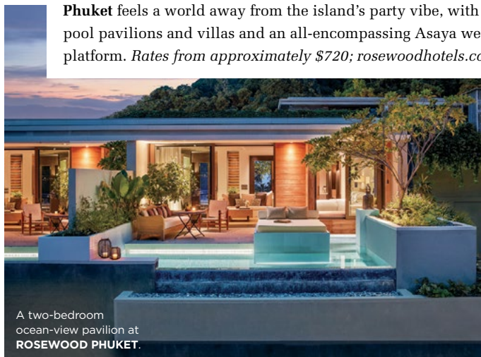
A two-bedroom ocean-view pavilion at ROSEWOOD PHUKET .

Does the word “Phuket” fill your mind with visions of raucous backpackers and seedy hostels? Well, think again: There’s a reason the luxe Rosewood brand chose the city’s beguiling Emerald Bay as the site of its first Southeast Asian property. The plush Rosewood Phuket feels a world away from the island’s party vibe, with 71 pool pavilions and villas and an all-encompassing Asaya wellness platform. Rates from approximately $720; rosewoodhotels.com.