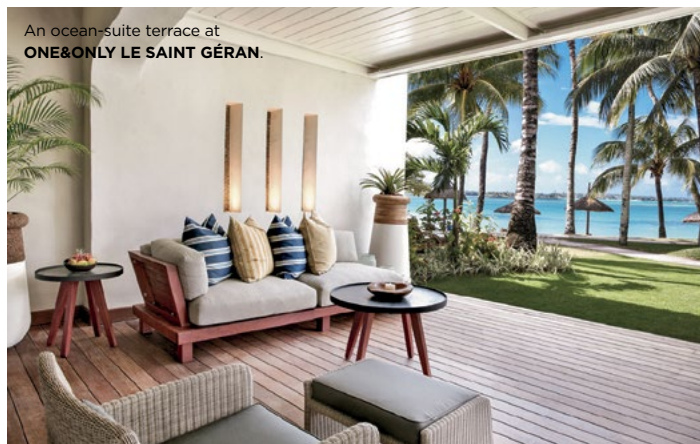
An ocean-suite terrace at ONE&ONLY LE SAINT GÉRAN .

When we say the opening of the Jewel Grande Montego Bay Resort & Spa is big news for Jamaica, we mean big: The all-inclusive spread has 217 rooms and 12 dining options among its three beachside towers. Yet, despite its supersize dimensions, the resort manages to retain an intimate feel, thanks to stellar service (private butlers, anyone?), a tranquil spa, and 11 stand-alone villas for guests who desire more privacy. Rates from $553; jewelgrande.com.