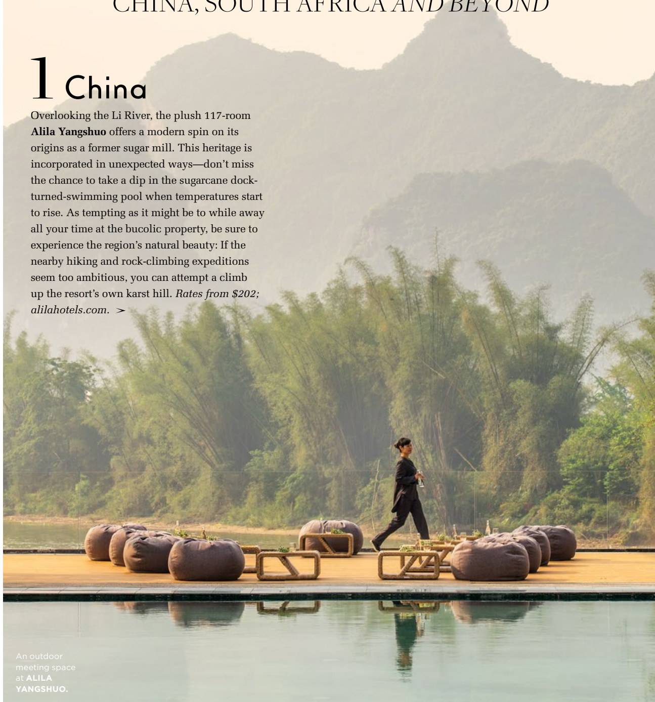
An outdoor meeting space at ALILA YANGSHUO .

Overlooking the Li River, the plush 117-room Alila Yangshuo offers a modern spin on its origins as a former sugar mill. This heritage is incorporated in unexpected ways—don't miss the chance to take a dip in the sugarcane dock-turned-swimming pool when temperatures start to rise. As tempting as it might be to while away all your time at the bucolic property, be sure to experience the region's natural beauty: If the nearby hiking and rock-climbing expeditions seem too ambitious, you can attempt a climb up the resort's own karst hill. Rates from $202; alilahotels.com . >