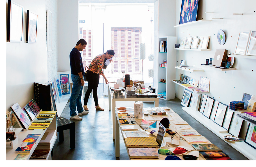
Clockwise from left: Outside Bandra 190; browsing the collection at Filter; shorts and tops at Obataimu.