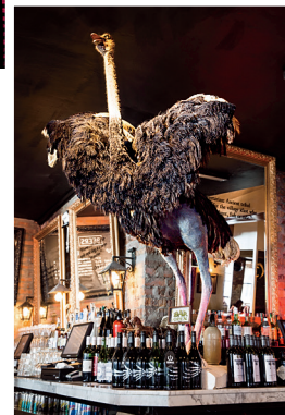
8 Village Idiot Lines running along Loop Street have been a common sight ever since the Village Idiot opened in May. If you make it inside, join locals swaying to live music on the balcony and by the pool table, or making the acquaintance of the Village Idiot himself: Oskar, the stuffed ostrich presiding over the bar. thevillageidiot.co.za .

with sumptuous velvet furniture and kinky Pop art murals that draw a sophisticated after-work crowd. tjingtjing.co.za .