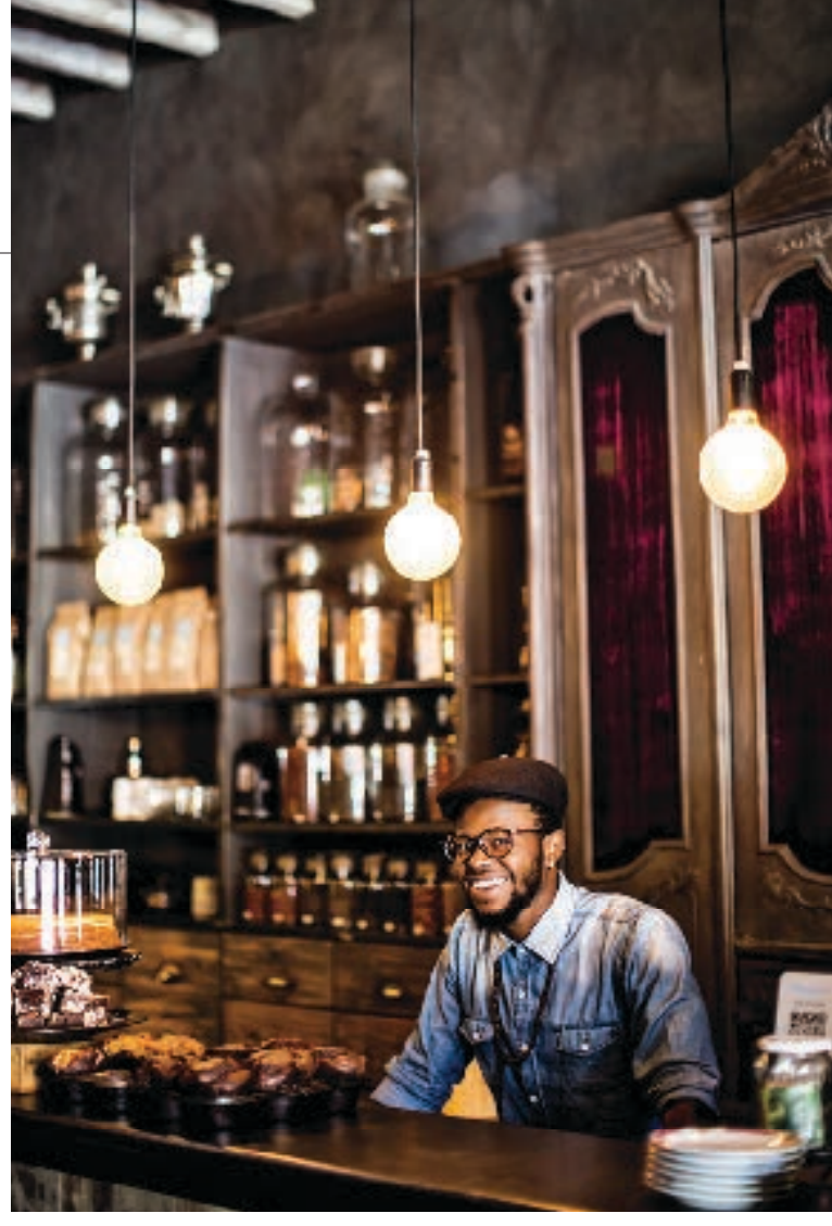
Haas Coffee, one of Cape Town's top cafés.