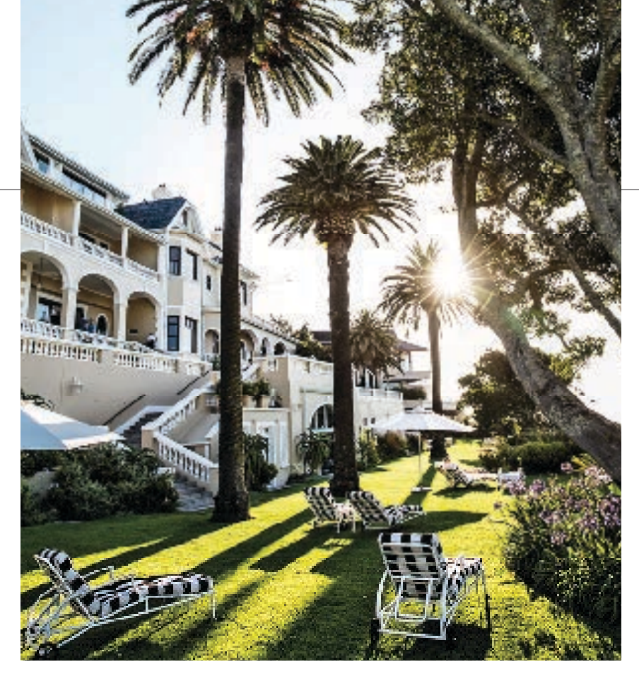
The well-tended ocean-view lawns at Ellerman House.